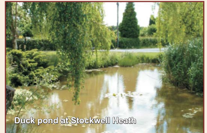
Duck pond at Stockwell Heath