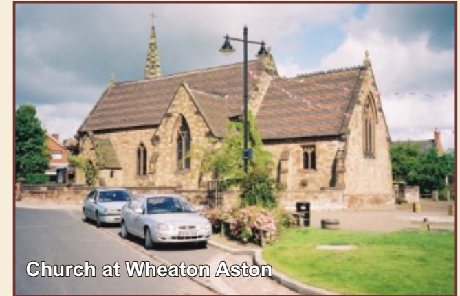
Church at Wheaton Aston

10 Walk left and then right walking through Bickford Meadows Nature Reserve Go through the bridlegate at the end and follow the field boundary around to a stile by a bridle gate on your right.