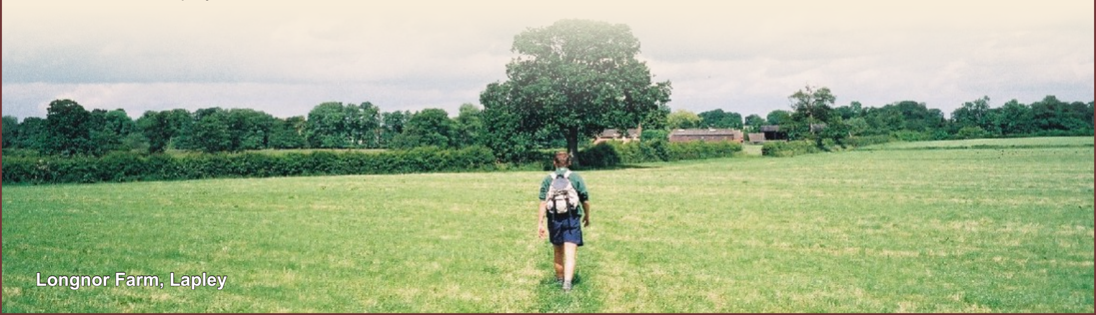
Longnor Farm, Lapley

Route between Lapley and Walsall. Route of Service 6