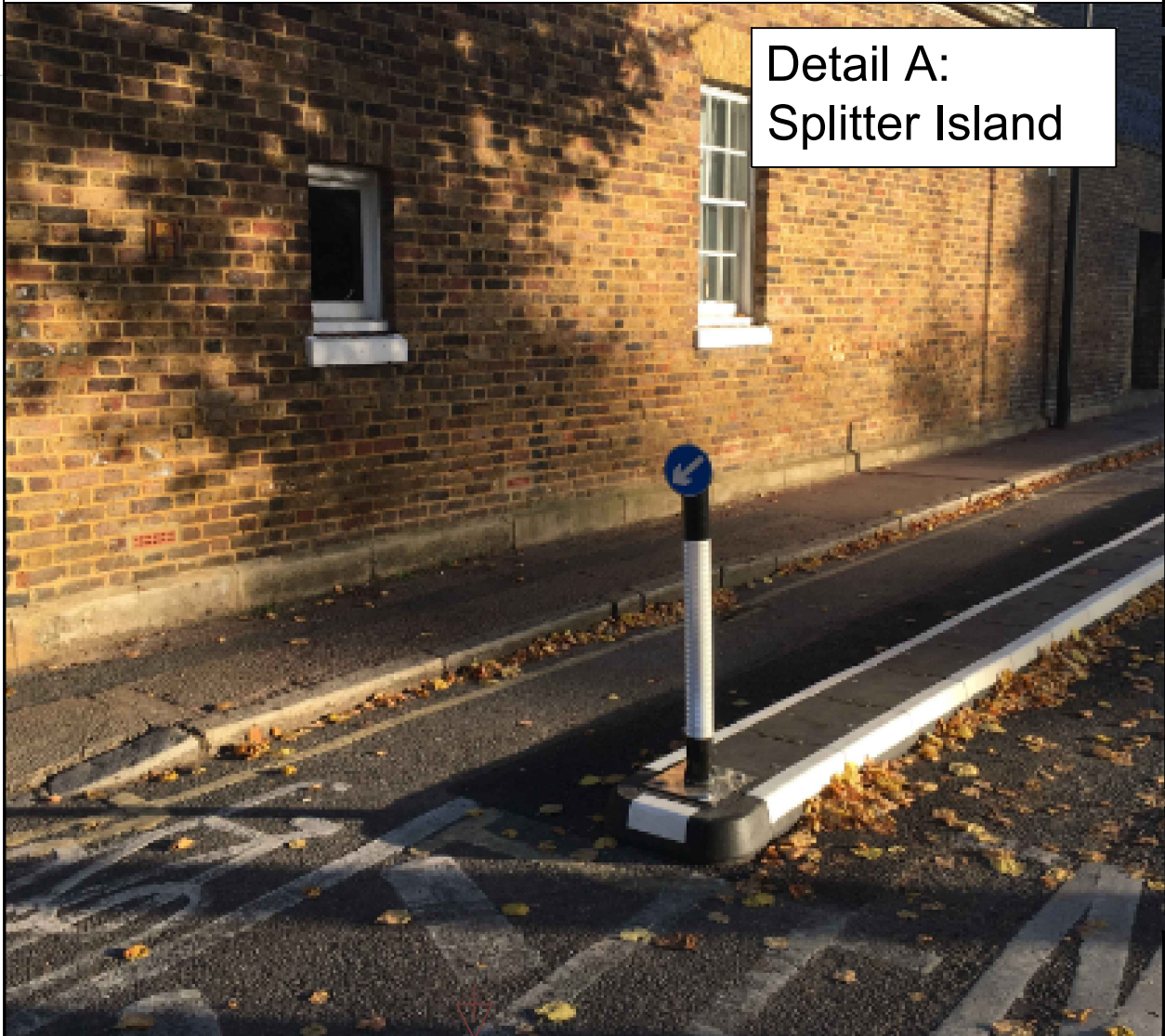
Detail A: Splitter Island