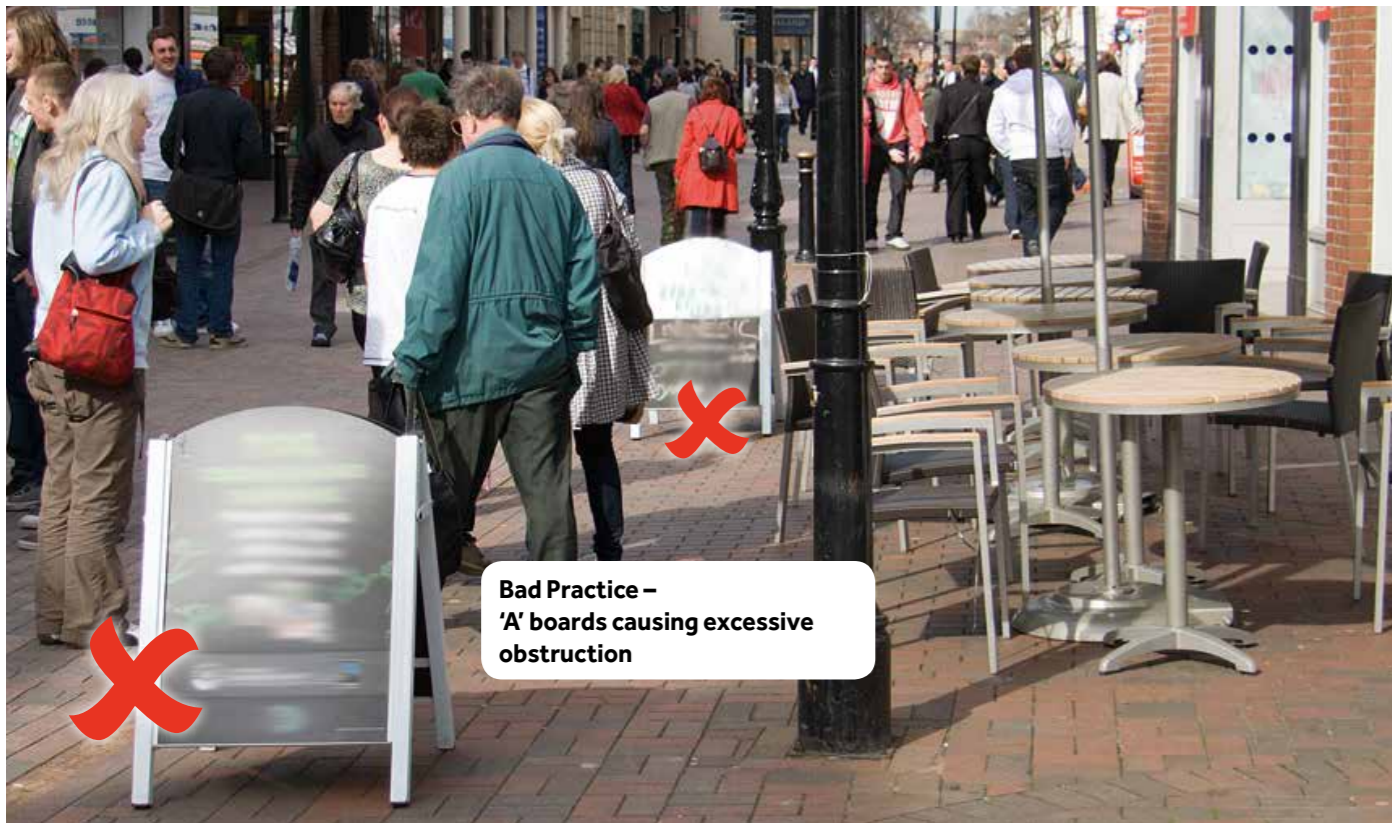
Bad Practice - 'A' boards causing excessive obstruction