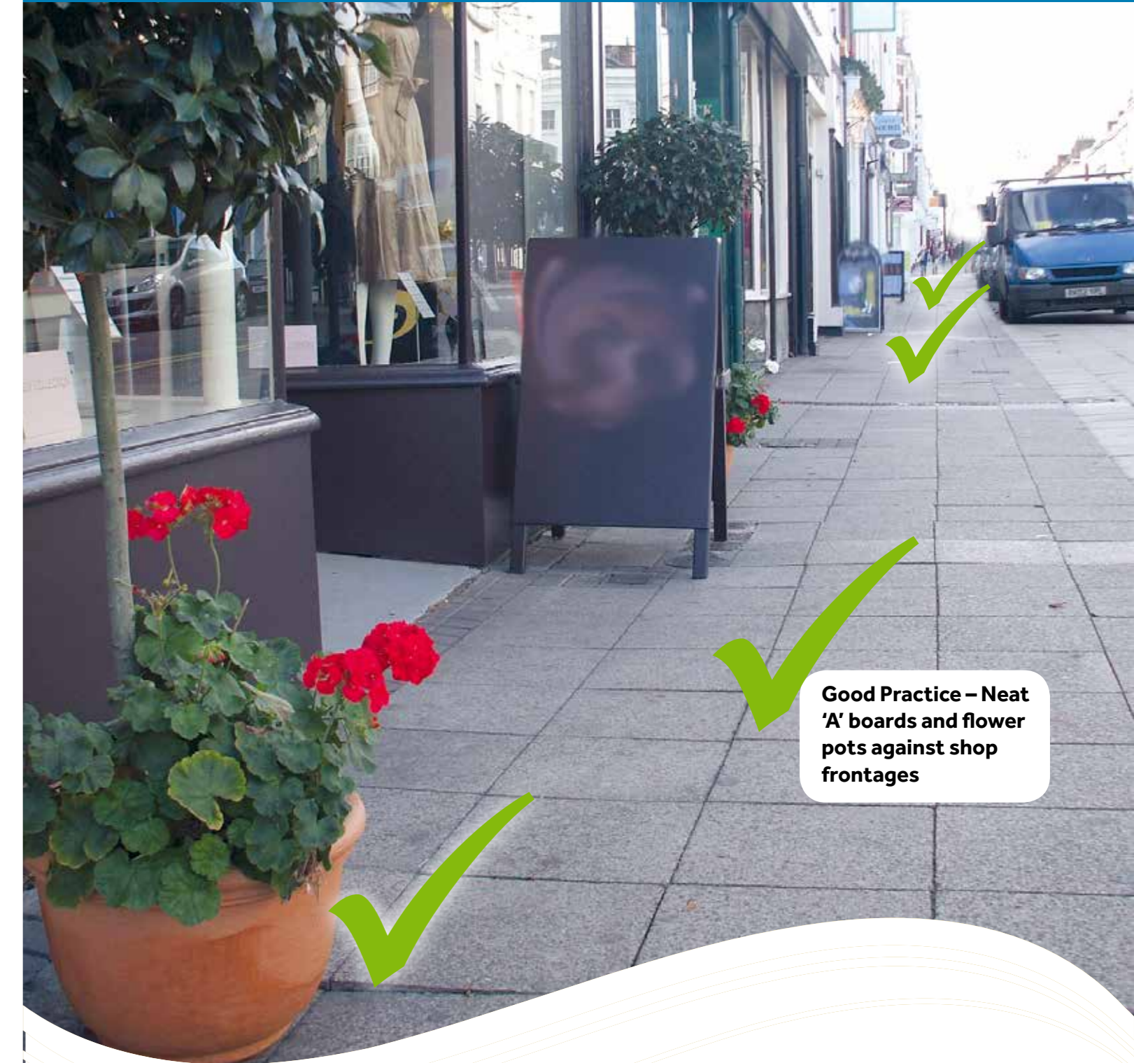
Good Practice - Neat 'A' boards and flower pots against shop frontages