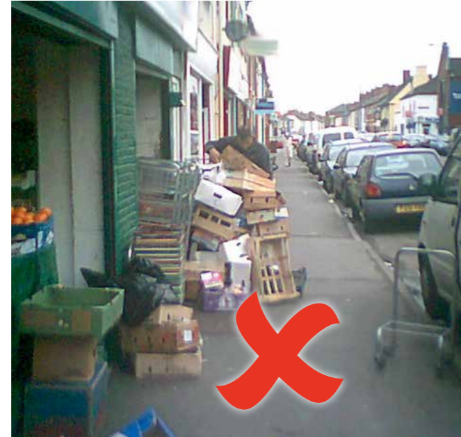
Bad Practice – Excessive obstruction to pedestrians

Anyone putting materials in the street is responsible for ensuring that they do not obstruct or endanger highway users, as this is an offence under the Highways Act 1980. If you decide to place materials in the street you will be fully and solely responsible for any accident or injury caused by your actions.