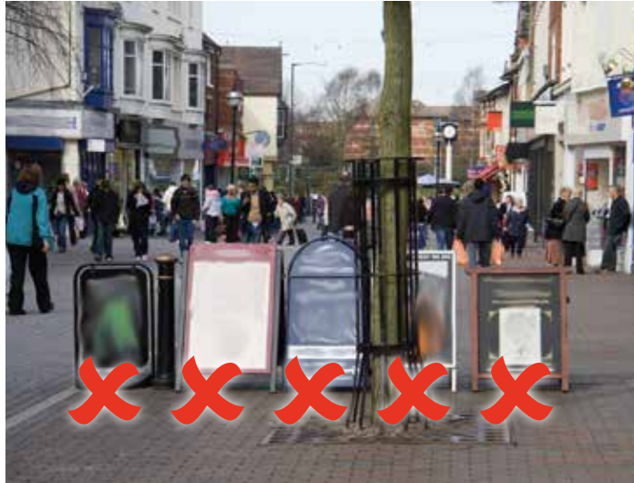
Bad Practice – 'A' boards obstructing footway

Under the Disability Discrimination Act 1995 we have to consider the disabled community when organising the street scene, and so do local shops and businesses. It's not just the law, it is a matter of common sense and respect for others.