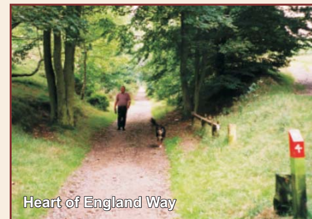
Heart of England Way