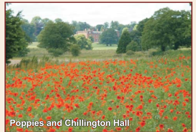
Poppies and Chillington Hall