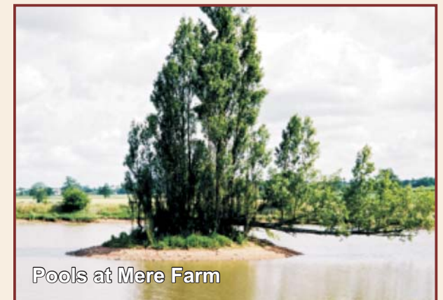
Pools at Mere Farm