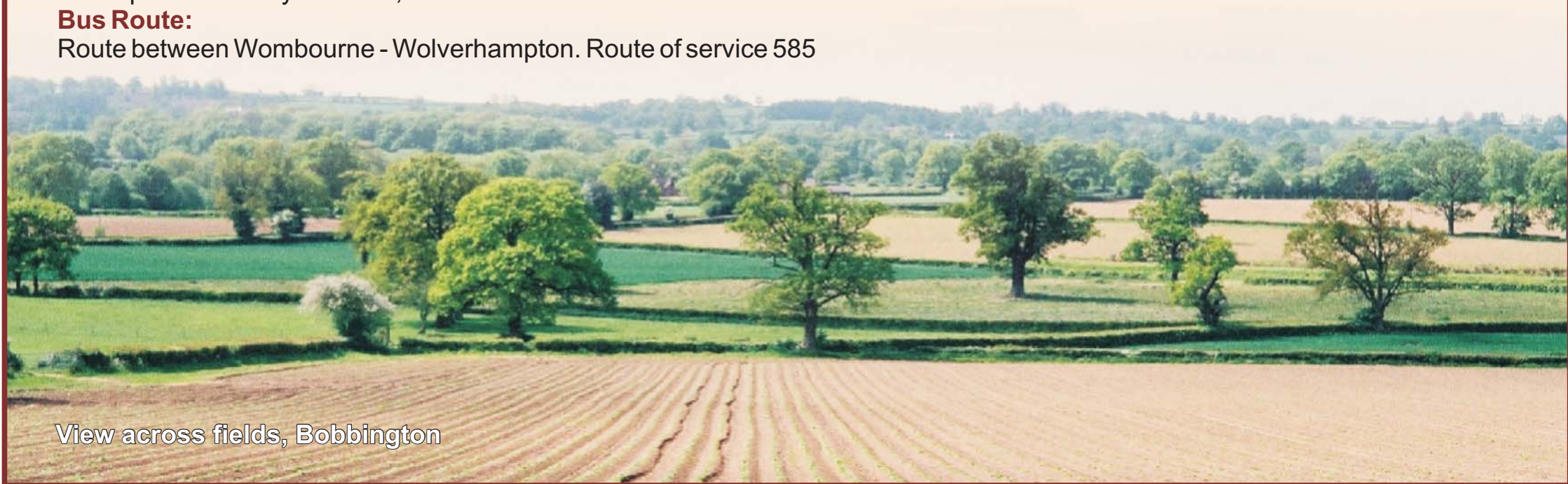
View across fields, Bobbington

Route between Wombourne - Wolverhampton. Route of service 585