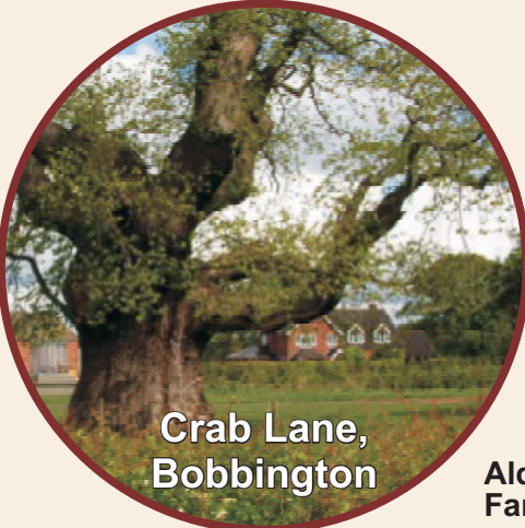
Crab Lane, Bobbington