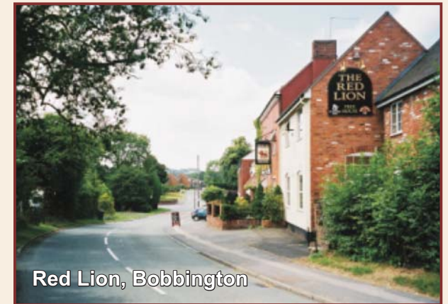
Red Lion, Bobbington