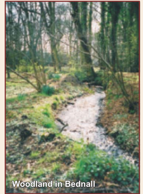
Woodland in Bednall