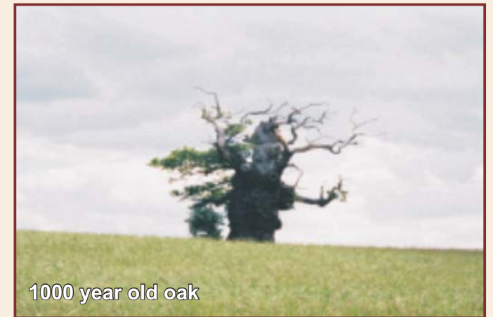
1000 year old oak