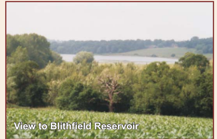
View to Blithfield Reservoir

11 Walk across the next field, heading towards the right corner where you pass through an open gateway. Cross half-right to the large oak tree in the protruding hedge corner. Walk directly across the field heading toward another oak tree, where you can see Blithfield Reservoir to your left.