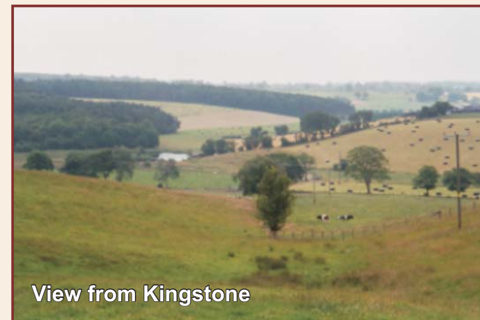
View from Kingstone