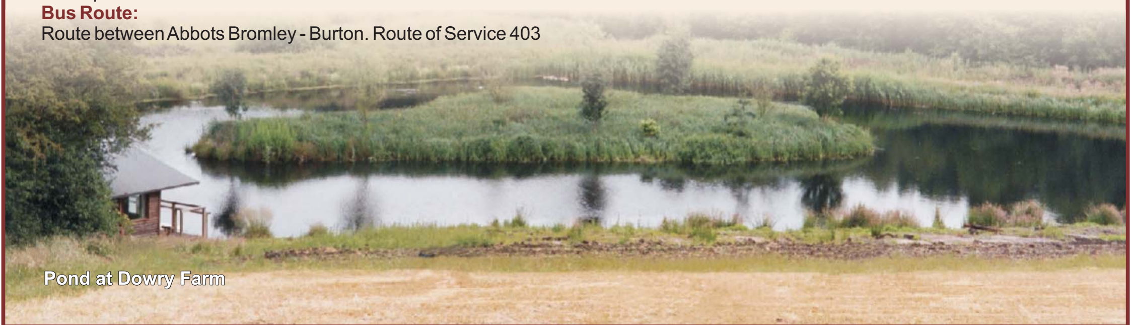
Pond at Dowry Farm

Route between Abbots Bromley - Burton. Route of Service 403