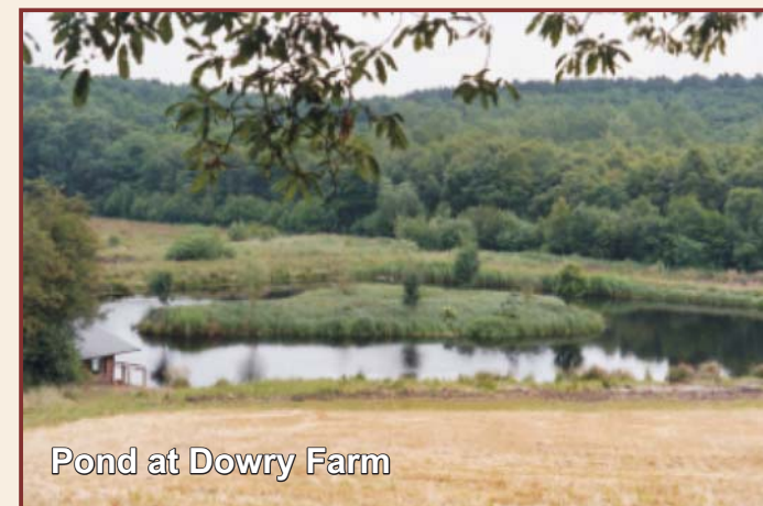
Pond at Dowry Farm

22 Continue through the farmyard walking down the concrete drive to the B5013. Turn left up the road and then right soon after into Hobb Lane.