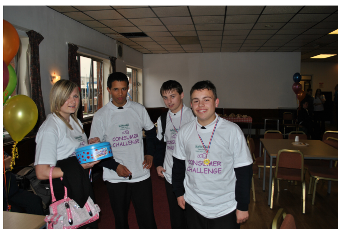
The winning team from Consumer Challenge Quiz

Overleaf are a couple of photos showing some of the work the Scheme has been involved in during the last 12 months.