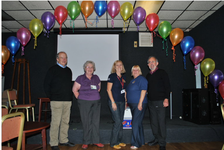
Watchdogs helping out at Consumer Challenge Quiz