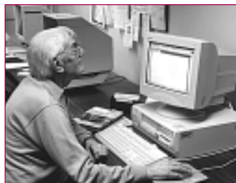
One of our regular readers using the CD rom

These can be used by booking the computer for one hour slots.