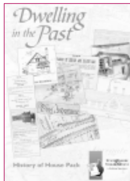
Dwelling in the Past

These are available to personal callers to the Archive Service or by post from Staffordshire Record Office.