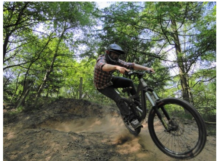
Taken by James Good, Year 10/11 winner

Our photograph competition has just finished. We asked young people aged 9 to 16 years old to capture a shot that shows what transport in Staffordshire means to them. Here are the winning photographs: