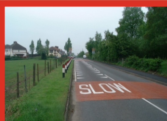
Burntwood Road gateway feature