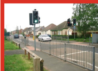
Brownhills Road toucan crossing