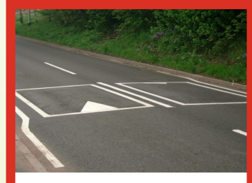
Norton East Road speed cushions