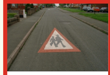
Railway Street school warning triangle