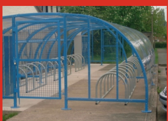
Norton Canes High School new cycle storage