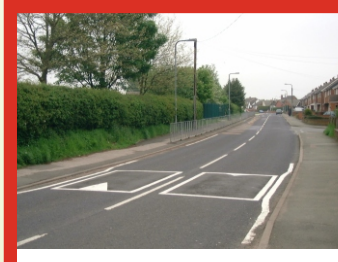
Chapel Street speed cushions