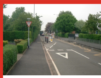
Burntwood Road traffic calming near to Norton Canes Primary