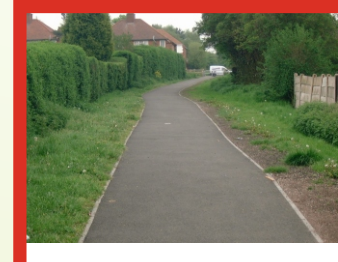
School Crescent to Norton East Road new footpath surfacing