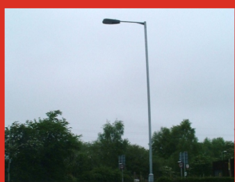
Norton East Road new lighting columns