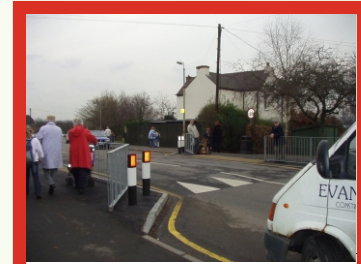
St Joseph's pedestrian entrance. Crossing facility, footpath widening and parking restrictions.