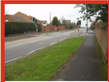
Ryknild Street/ Darnford Lane Junction alterations and new pedestrian crossing.