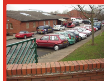
Saxon Hill School Improvement to drop off/pick up area.