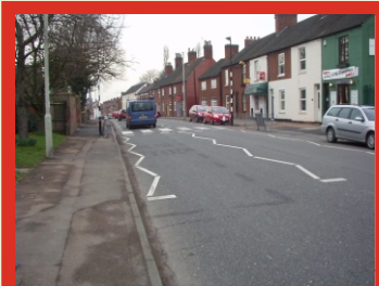
Upper St John St. Johnson entrance. New zebra crossing.