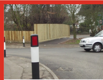
Kings Hill Road/ Borrowcop Lane New footpath and raised junction.