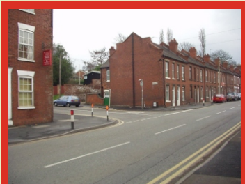
Upper St John St/ Cherry Orchard Crossing improvements