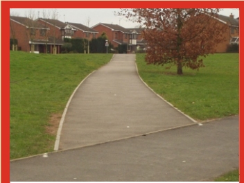
Roman Way/ Broad Lane New footpath