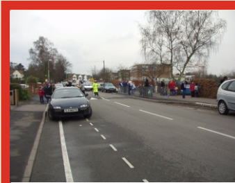
St Michael's pedestrian entrance. Crossing facility and footpath widening.