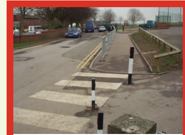
Kings Hill Road, Coach entrance. Footpath widening.