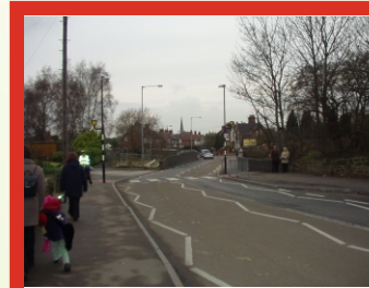
Sturgeon's Hill, railway bridge. New zebra crossing.