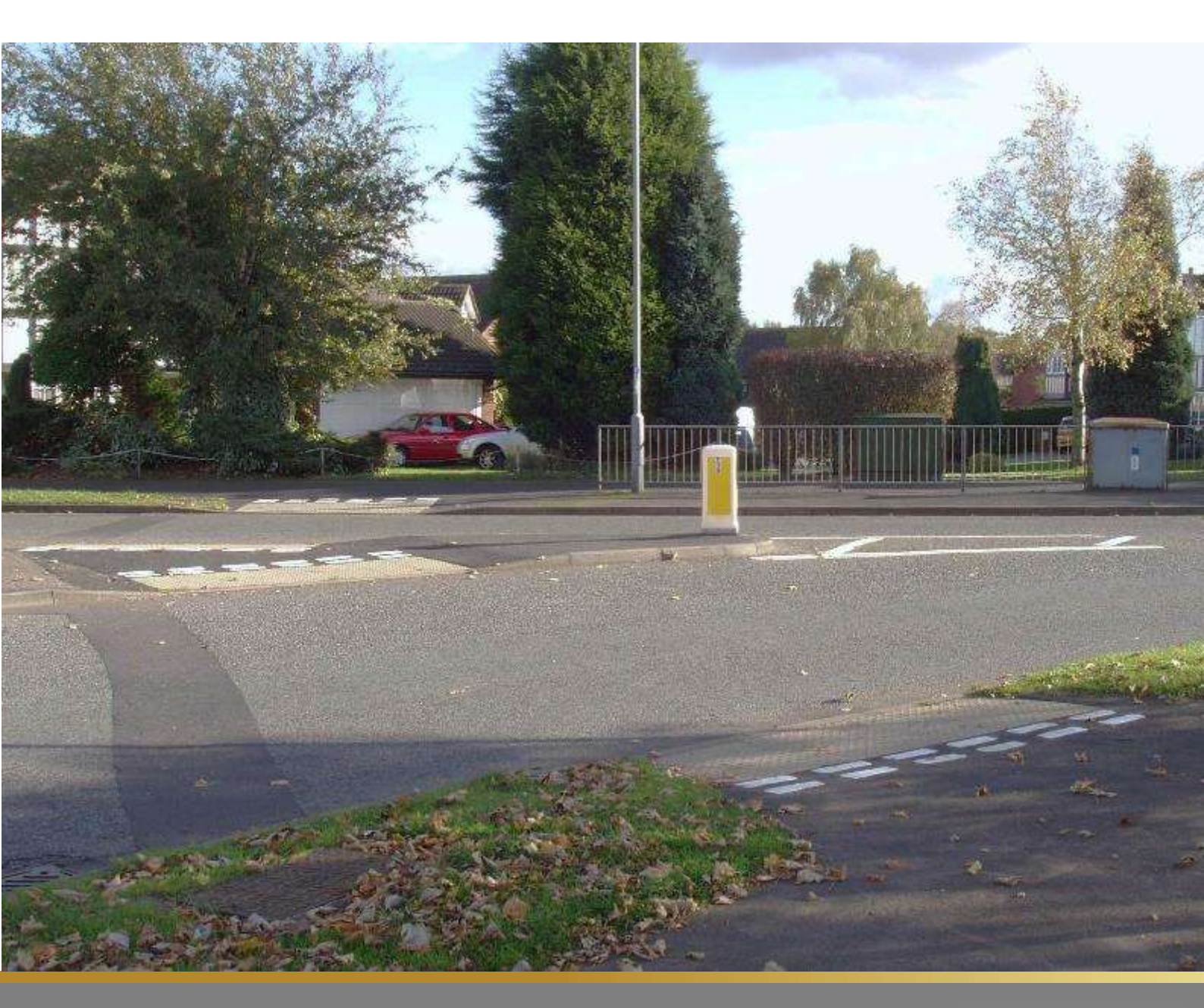
April 2024 Version 2.4.3